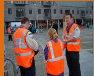
Marshaling the Falmouth Centenary Event – Oct 07

It is fairly safe to say that everyone had a thoroughly enjoyable weekend and that a 'shocking' time was had by all!